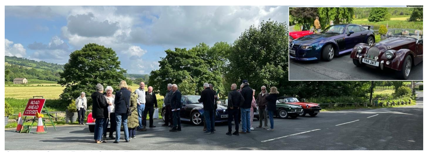
Gathering at Spread Eagle in Sawley. There are two Morgan's in there somewhere, the rest were in the other car park.

The day started early at 9:30 gathering at the Spread Eagle in Sawley aiming for a 10 o'clock start for the social run to the museum.