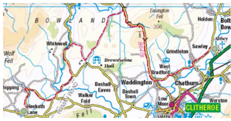
Social run route

Robin and Ann had sorted an excellent route for us to follow and provided route directions but amazingly I think everyone managed to stay in convoy so, for me at least, it was just a case of following the car in front. The route was 20 miles through some lovely scenery, over Easington Fell, past the Inn at Whitewell and took about 50 minutes. The weather was sunny and the roads smooth (mostly), the scenery was