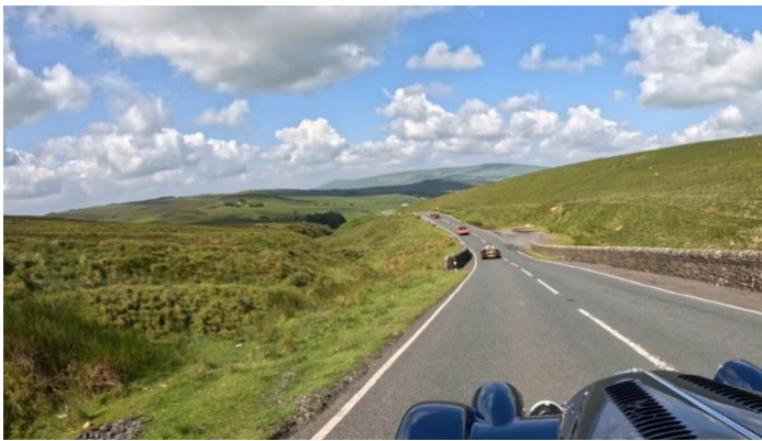
Over Easington Fell