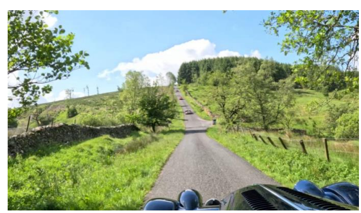
Heading South West towards Whitewell