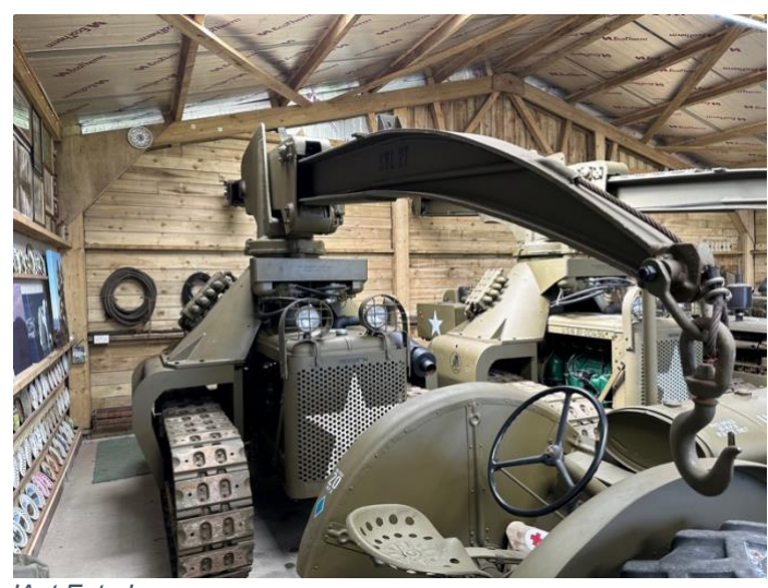
Ant Eater' crane

Terry also owned two cranes called 'Ant Eaters', Terry thought these were the only two in working order in the world. When bought the tracks were seized solid and one of the engines was cracked so they were both stripped down and restored and now look immaculate.