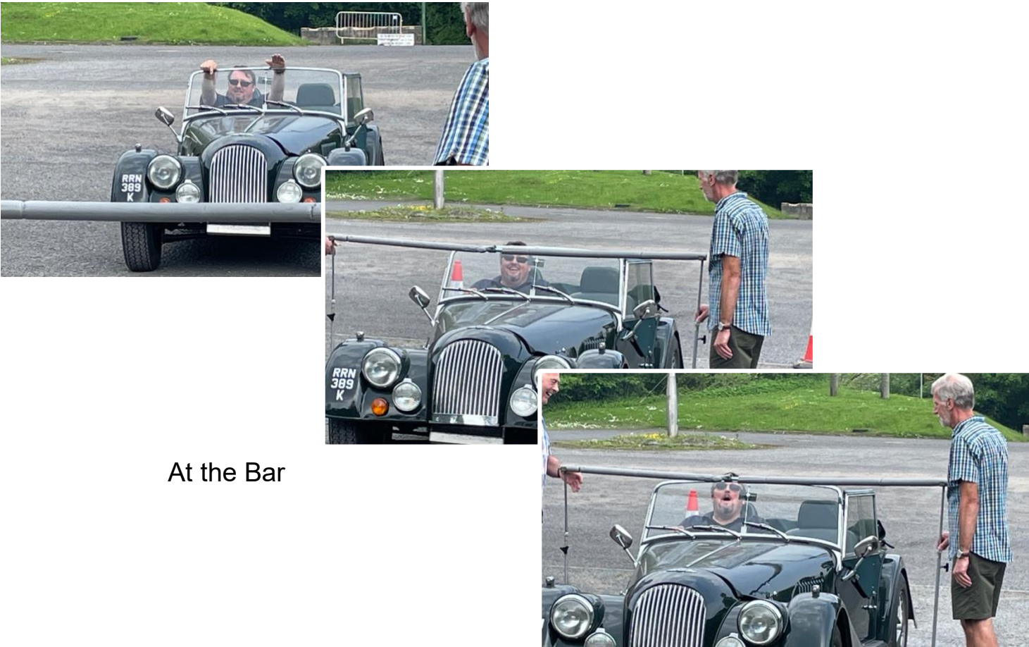
At the Bar