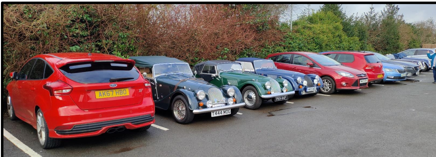
Member's Mogs & Tin Tops at the February Meet up.