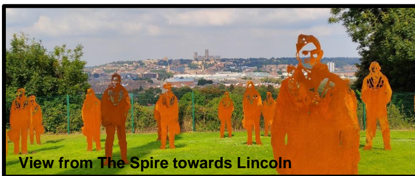
View from The Spire towards Lincoln