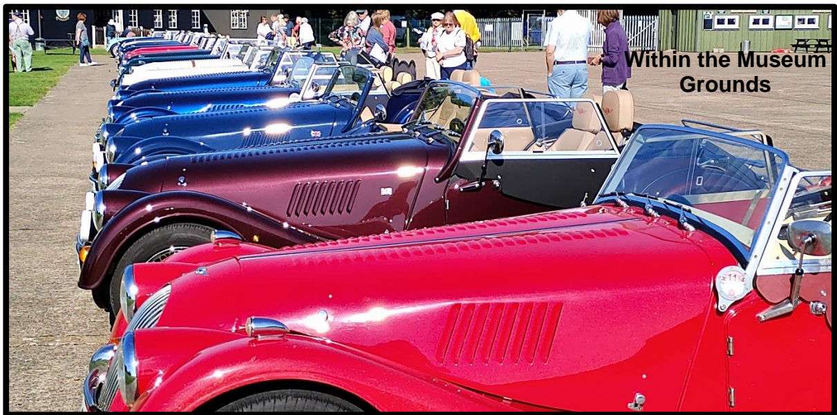
Within the Museum Grounds

Needless to say, our first port of call was to the NAAFI for coffee and cake before visiting the main hangar on the site.