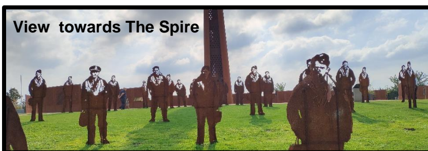
View towards The Spire

The Peace Garden also contains a Memorial Spire at 102 feet tall (the wingspan of an AVRO Lancaster) and Walls of Names.