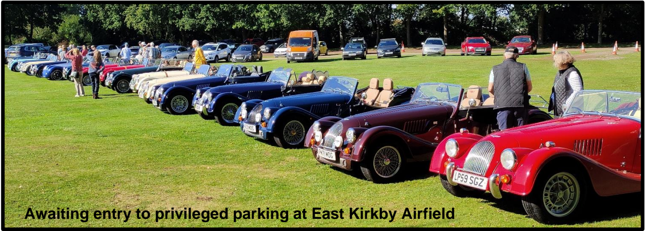
Awaiting entry to privileged parking at East Kirkby Airfield

Needless to say, our first port of call was to the NAAFI for coffee and cake before visiting the main hangar on the site.