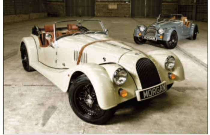
The Morgan Roadster launched in 2004

The final stages of the Roadster until discontinuation of the steel chassis car in 2019, had Ford's 3726cc V6, sourced from the US Ford Mustang, with 280 BHP and 280 ft/lbs of torque meaning the power had increased significantly from that of the final 4.6 litre Plus 8.