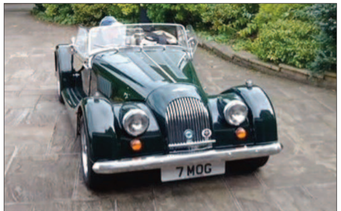
In Fond Remembrance - Bryan Fearn...now with Linda. 1980 Plus 8. Rover 3.5 V8. 1998 Plus 8. Rover 4.6 V8.