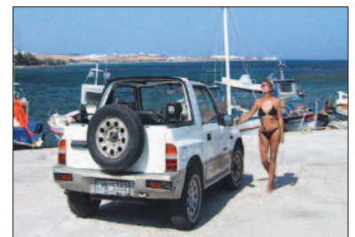
Piso Livadi fishing harbour, Paros

After days in the jeep, on the island we tour, it's days in Naoussa, to chill out some more.