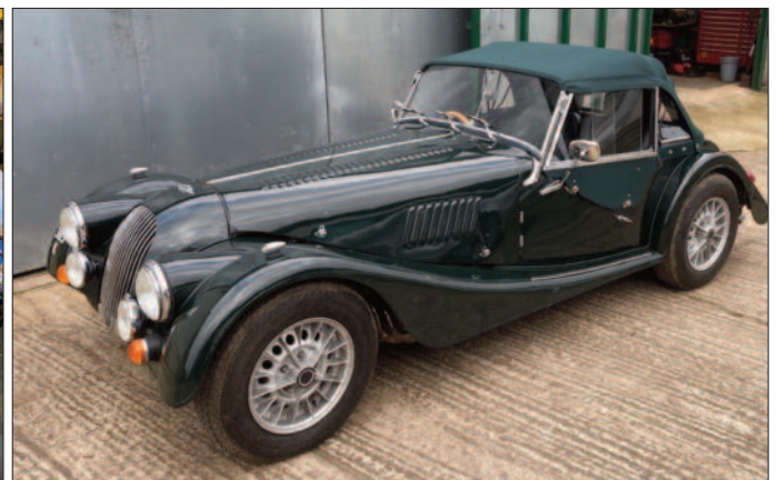
Andy Bleasdale. Original Parts 1973 Plus 8. Rover 3.5 V8. Re-built/engineered 2018. Rover 3.9 V8.