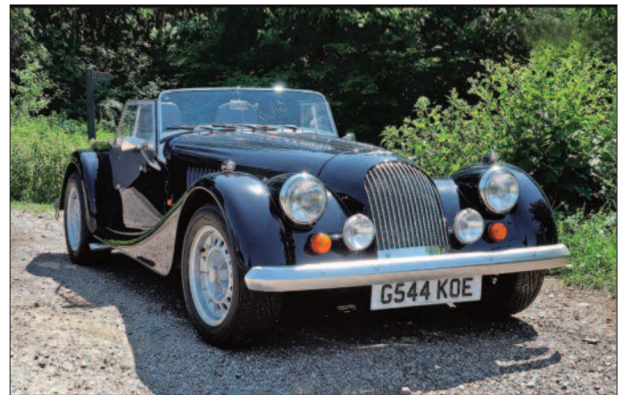
The Morgan Plus 8 launched in 1968

The original 1968 Plus 8 was 57 inches wide and the later models 64 inches, with an optional wider body at 67 inches. From the 1960s (and according to all the auto magazines) through to the 1980s, the acceleration of the Plus 8 between 20-80mph, was the fastest of any production car on the market.