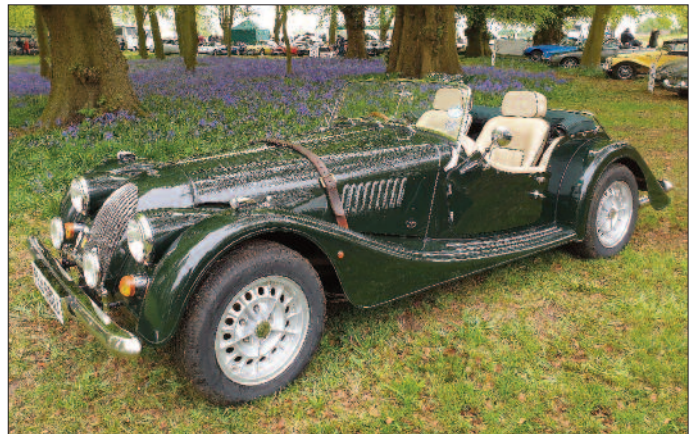
Jay & Yvonne Hale. 2002 Plus 8. Rover 4.0 Gems V8