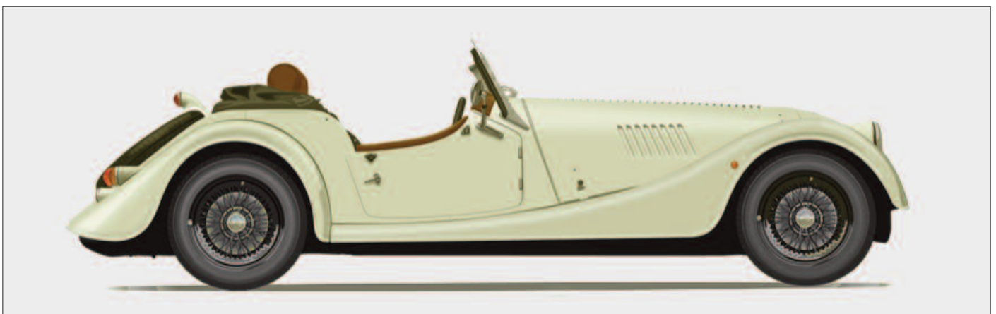
The classic body styling profile of a Morgan, with the Roadster remaining much the same as the original Plus 8

After phasing out the Rover V8-powered Plus 8 in 2004, Morgan announced this new Ford V6 powered model, a classic destined to continue being a driving force on the road - that was simply called the Roadster.