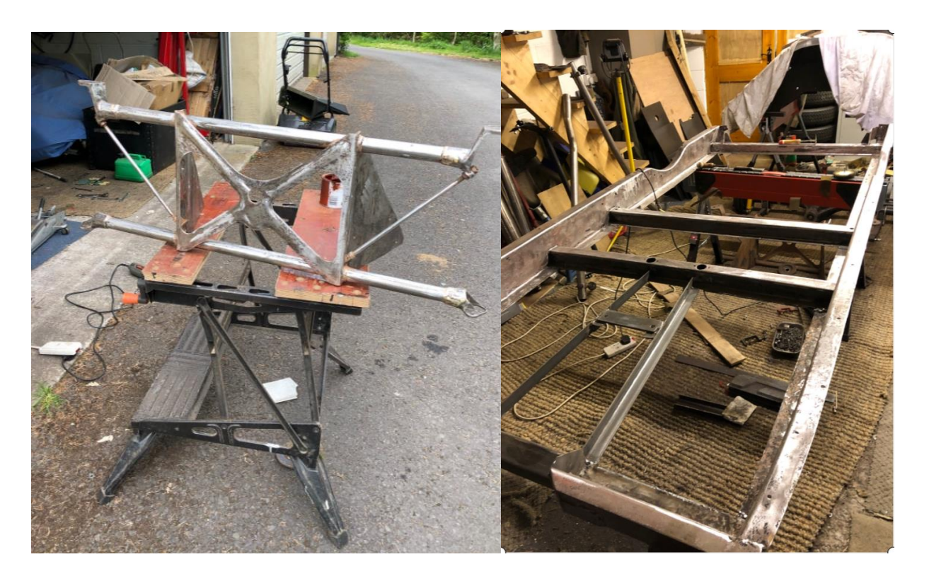
Crosshead and Chassis stripped

Next instalment in July's newsletter....,