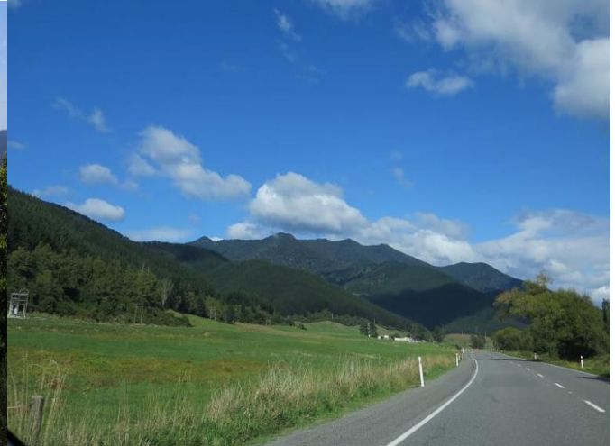
Picture 1 – Whackapapa Waterfall Picture 2 – Moawhango Picture 3 – Pelorus Sound Picture 4 – Pelorus Valley