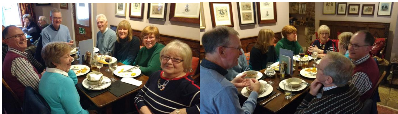
A few photos from the Inn at Whitewell