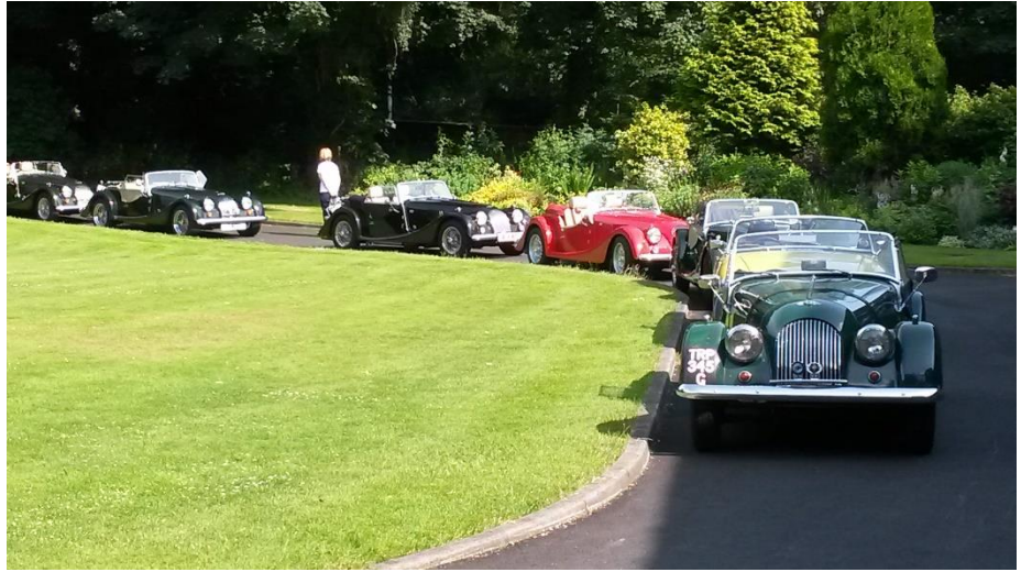
Privileged Car Park