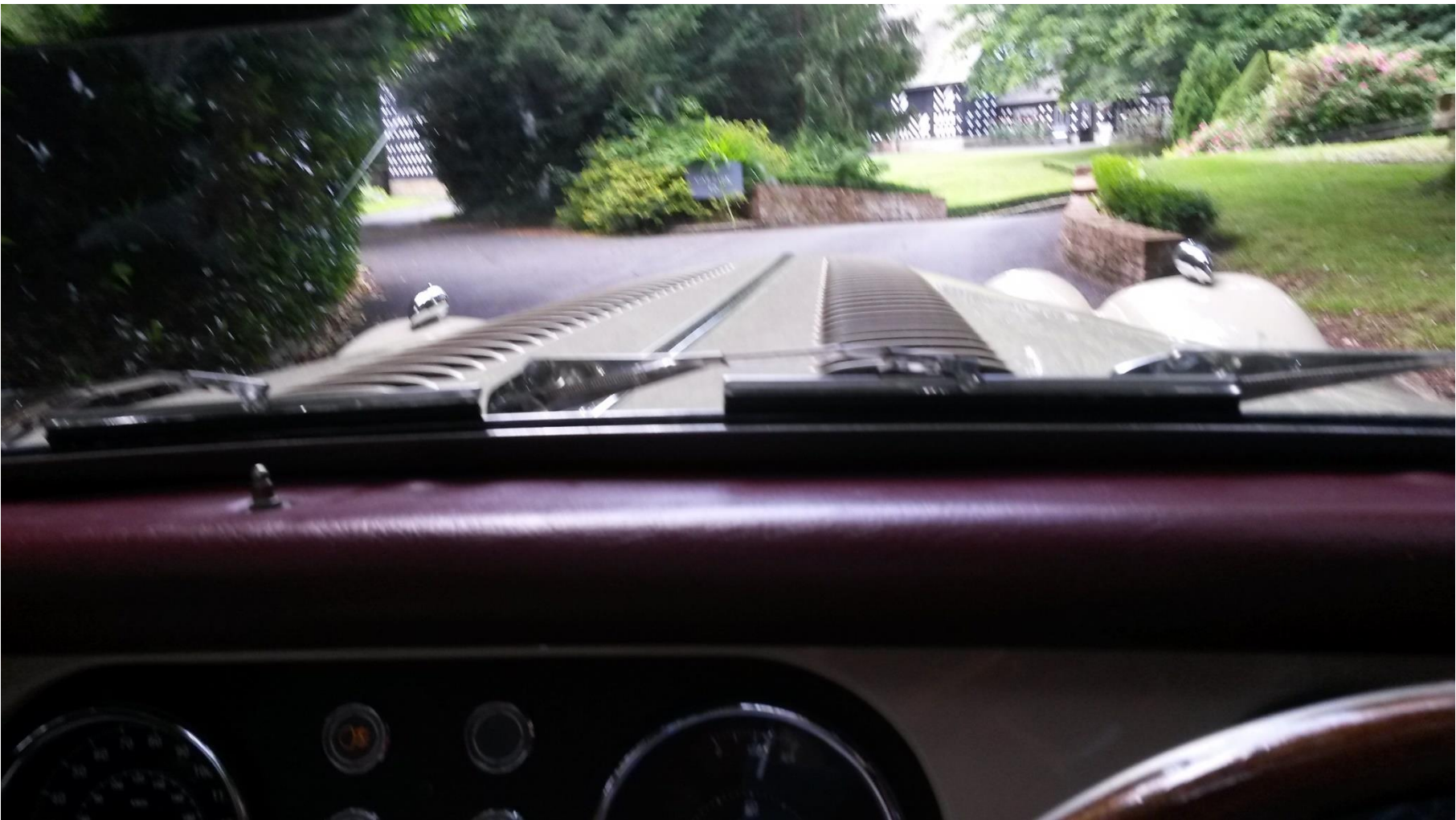
Entering Samlesbury Hall for Afternoon Tea