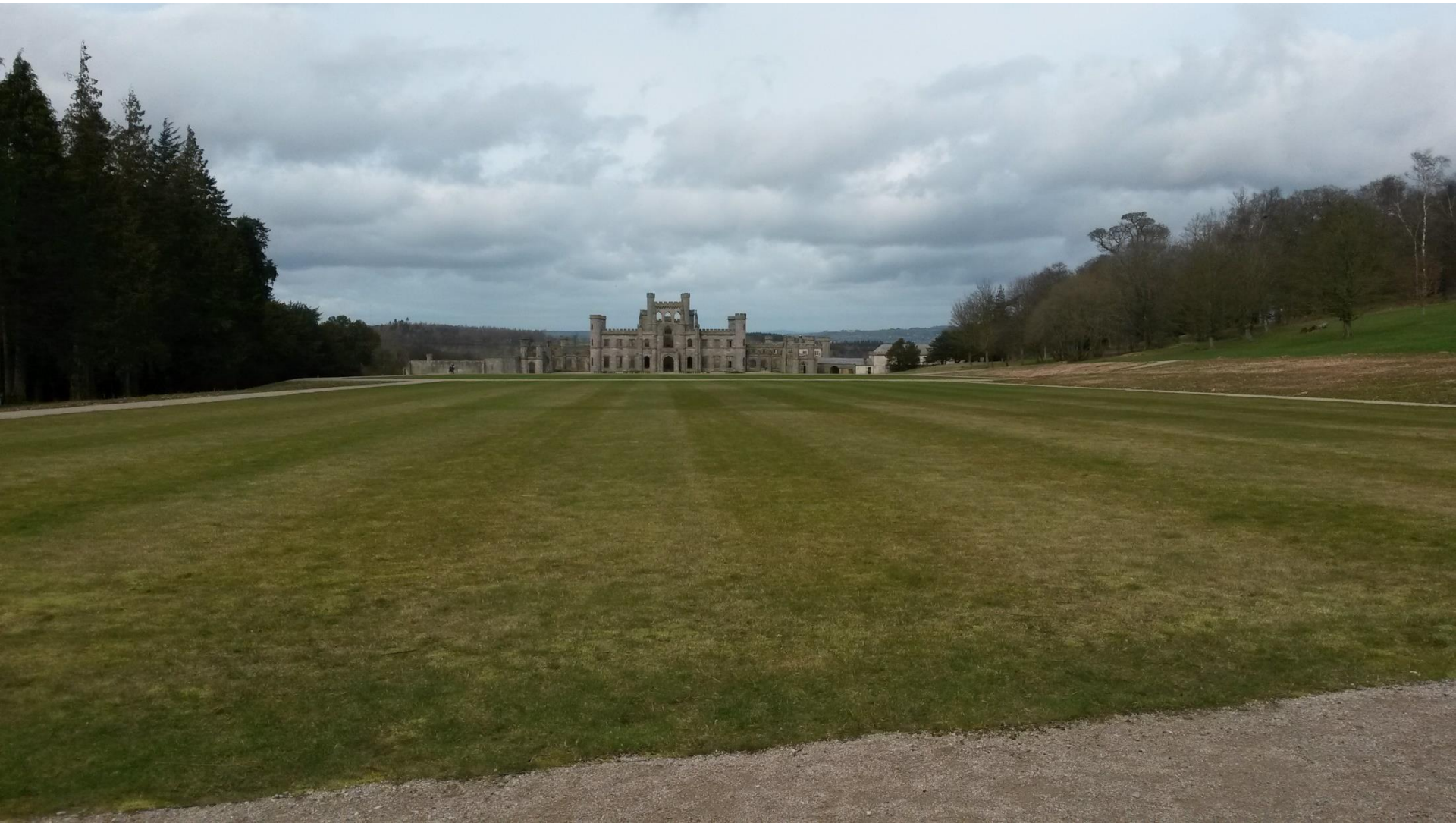
Part of the reclaimed area that was a 'forest' of pine trees before work began