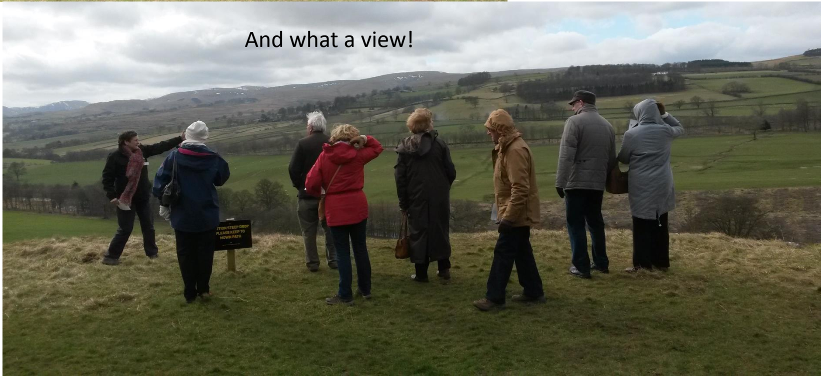
And what a view!