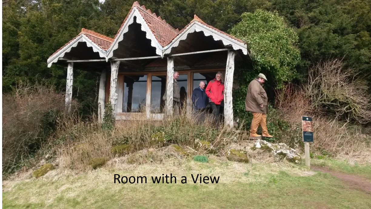
Room with a View