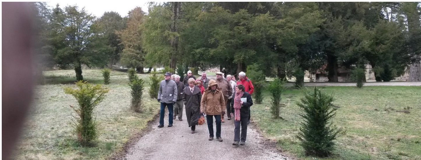
The 'new' Yew tree walk