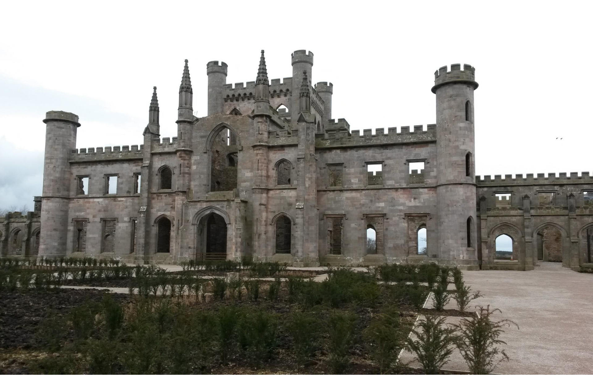
The stabilised walls of the original castle building