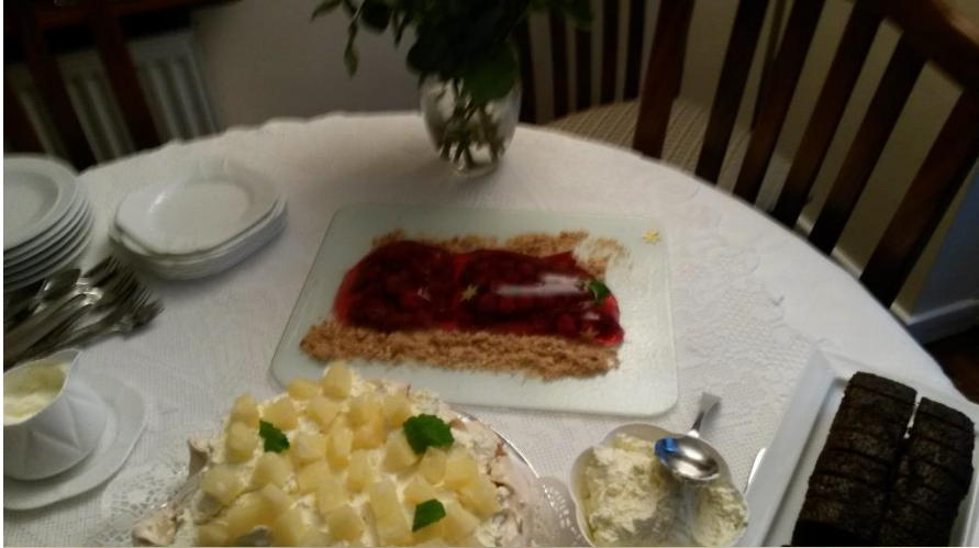
Isobel's red jelly Morgan Slight damage to front nearside wing – tasted marvellous! and other delicious desserts!