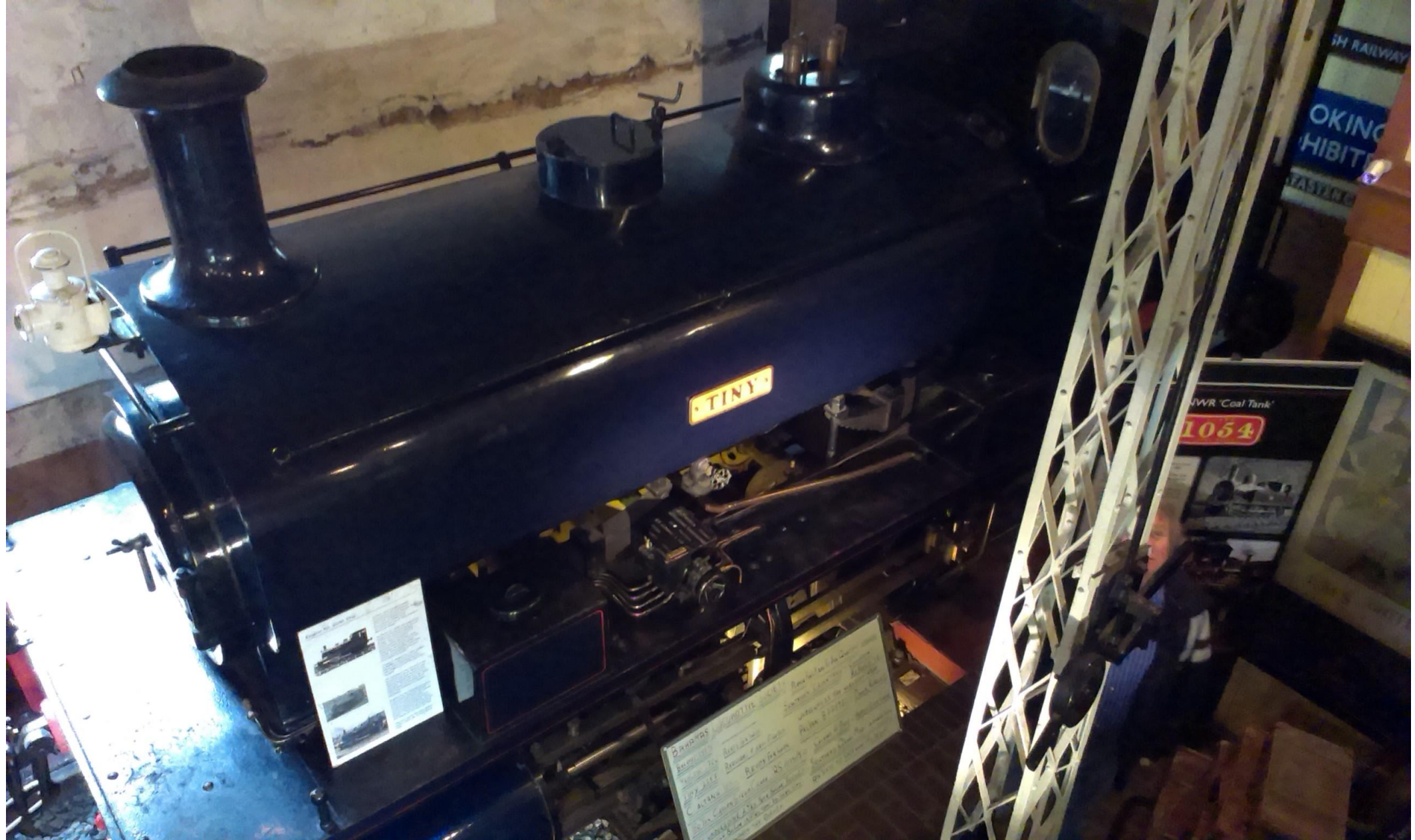
The Exhibition Centre at Ingrow Station