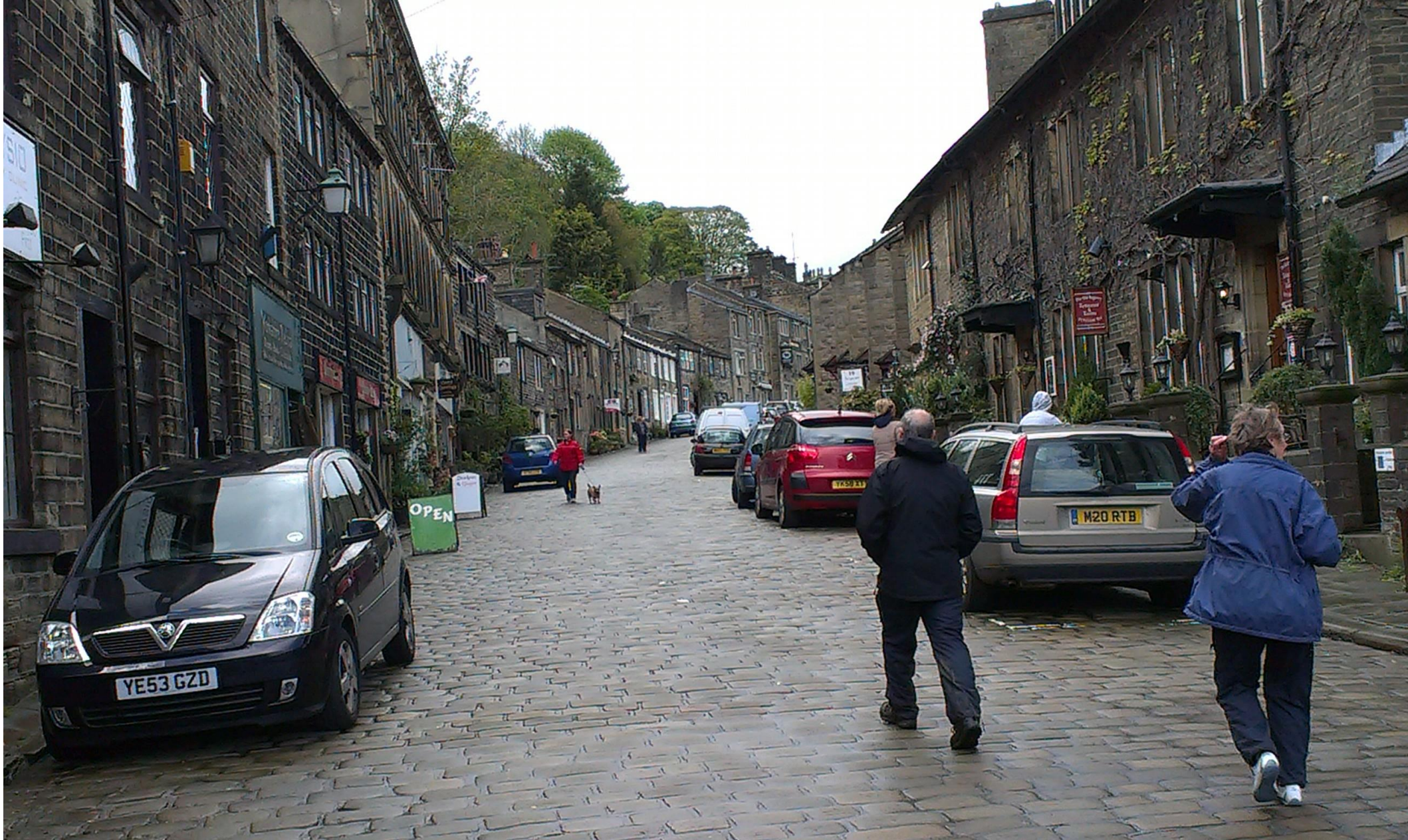
Picturesque Village of Haworth, one of the stop off points