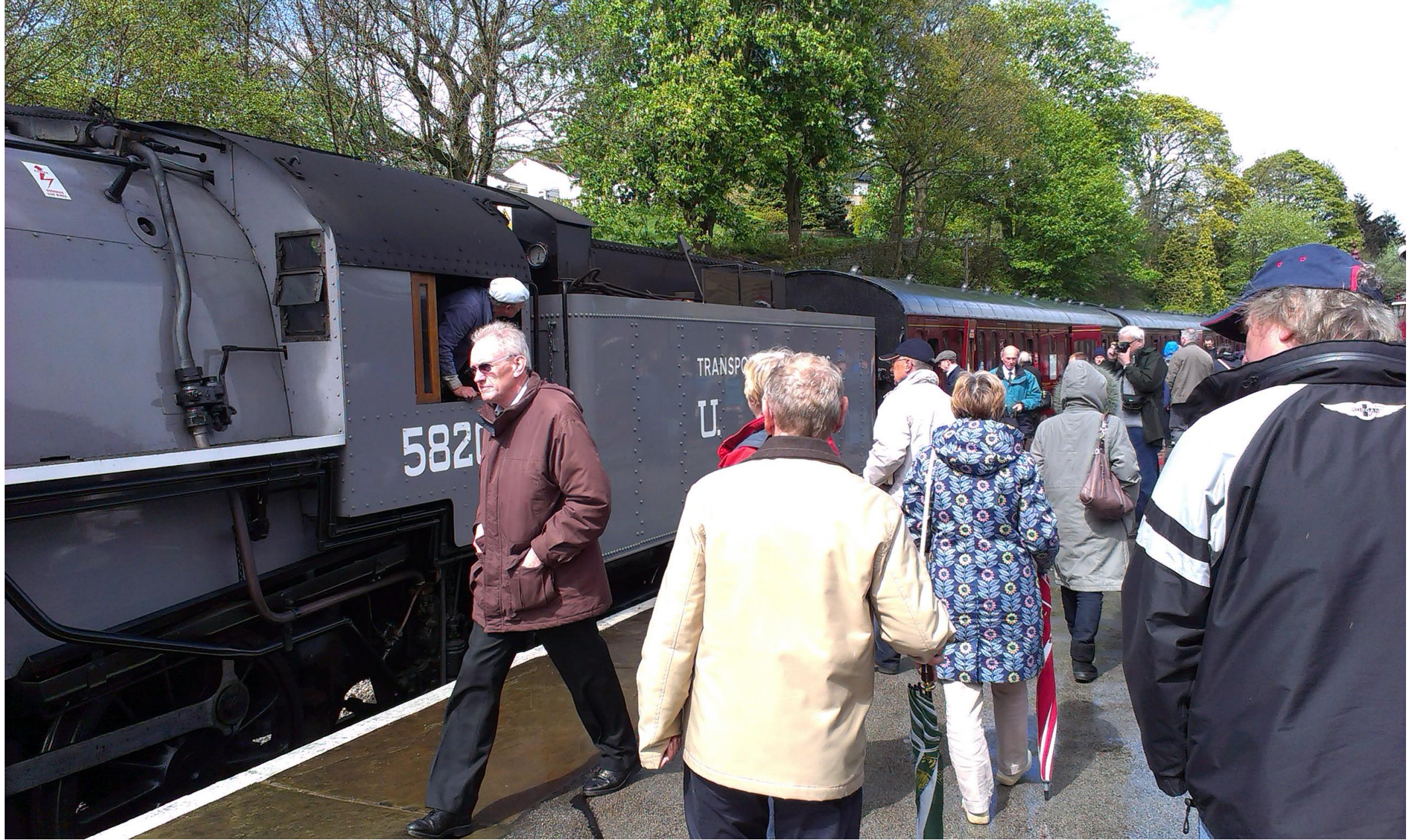
USA S160 No. 5820 "Big Jim"