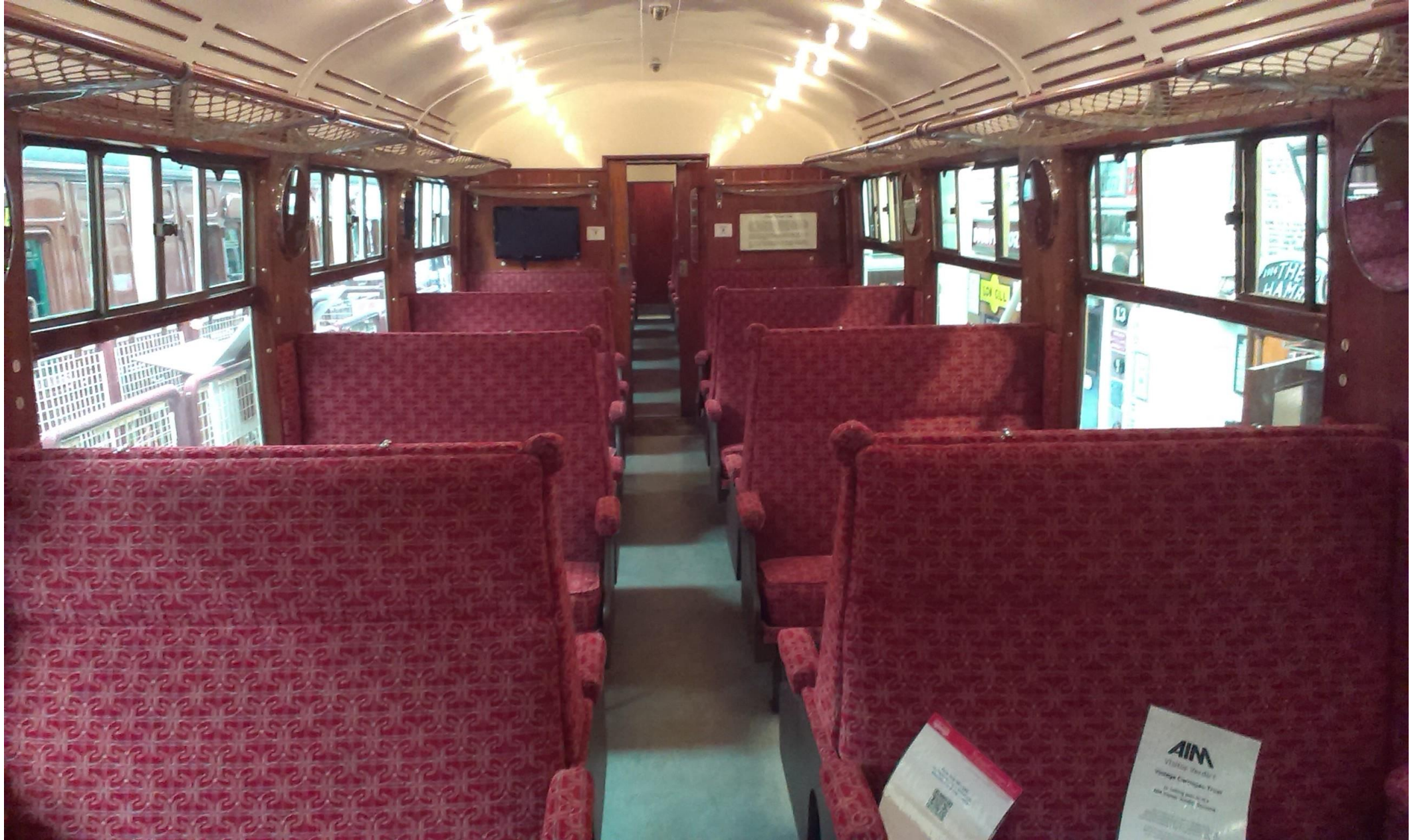
The Museum at Ingrow Station