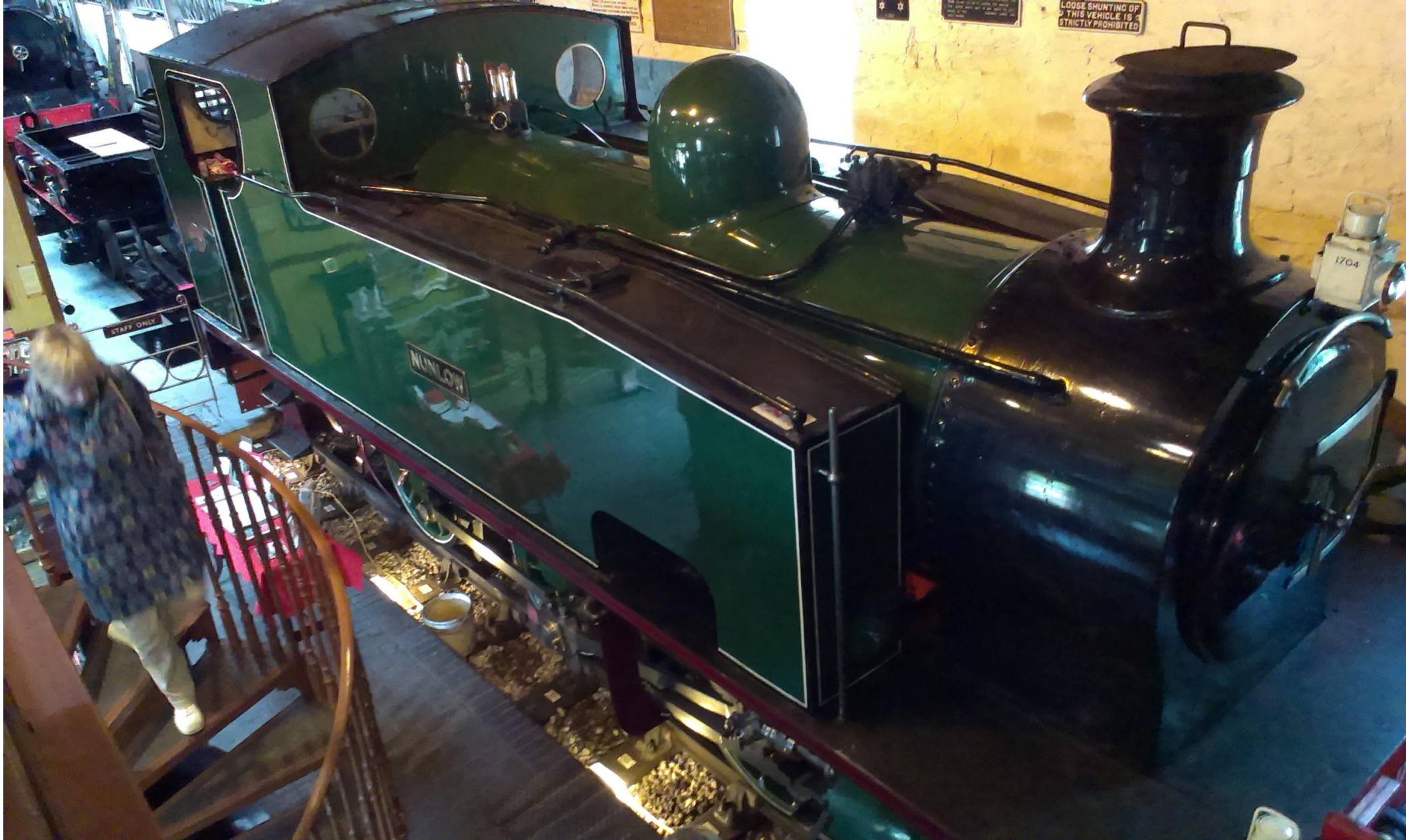
The Exhibition Centre at Ingrow Station