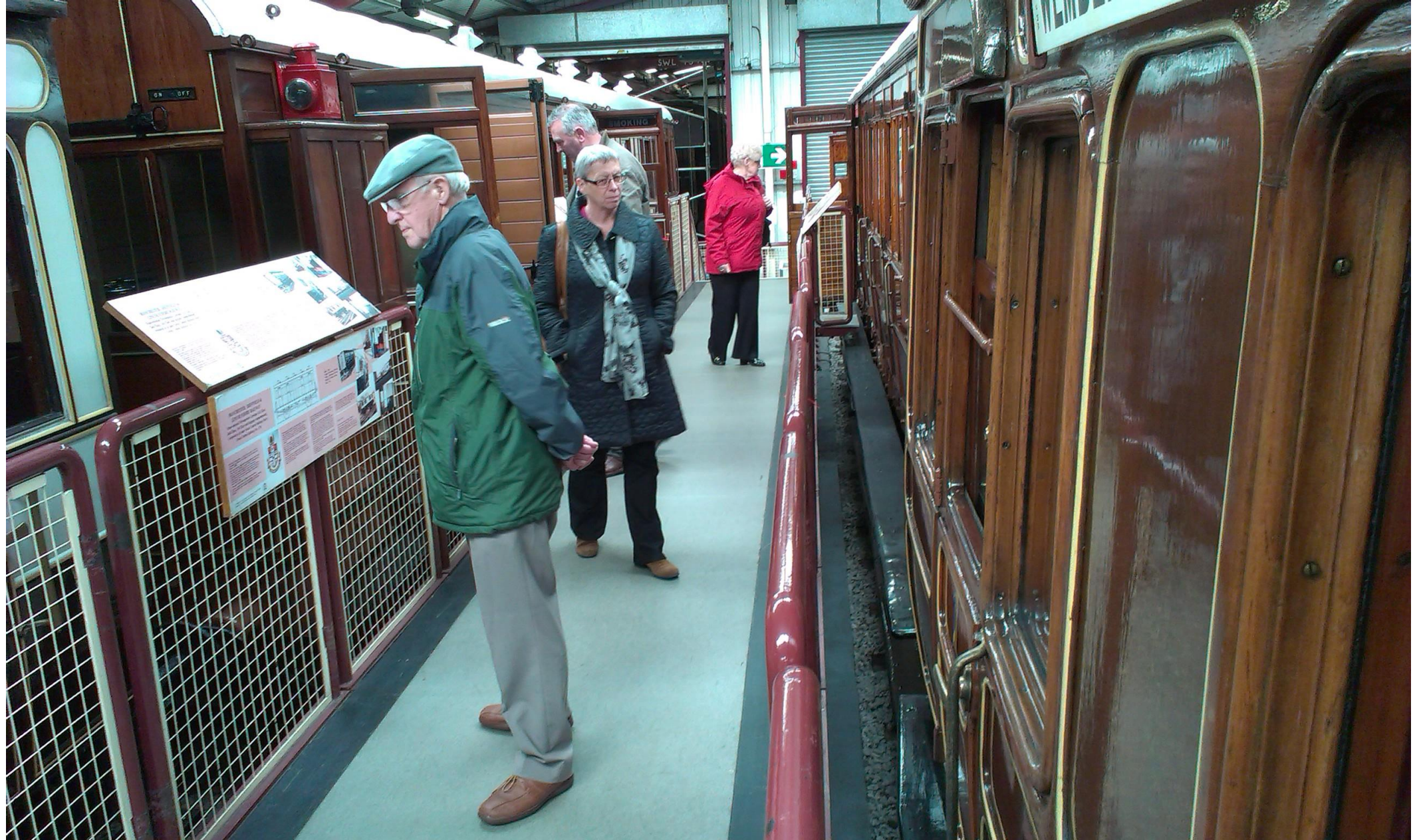
The Museum at Ingrow Station