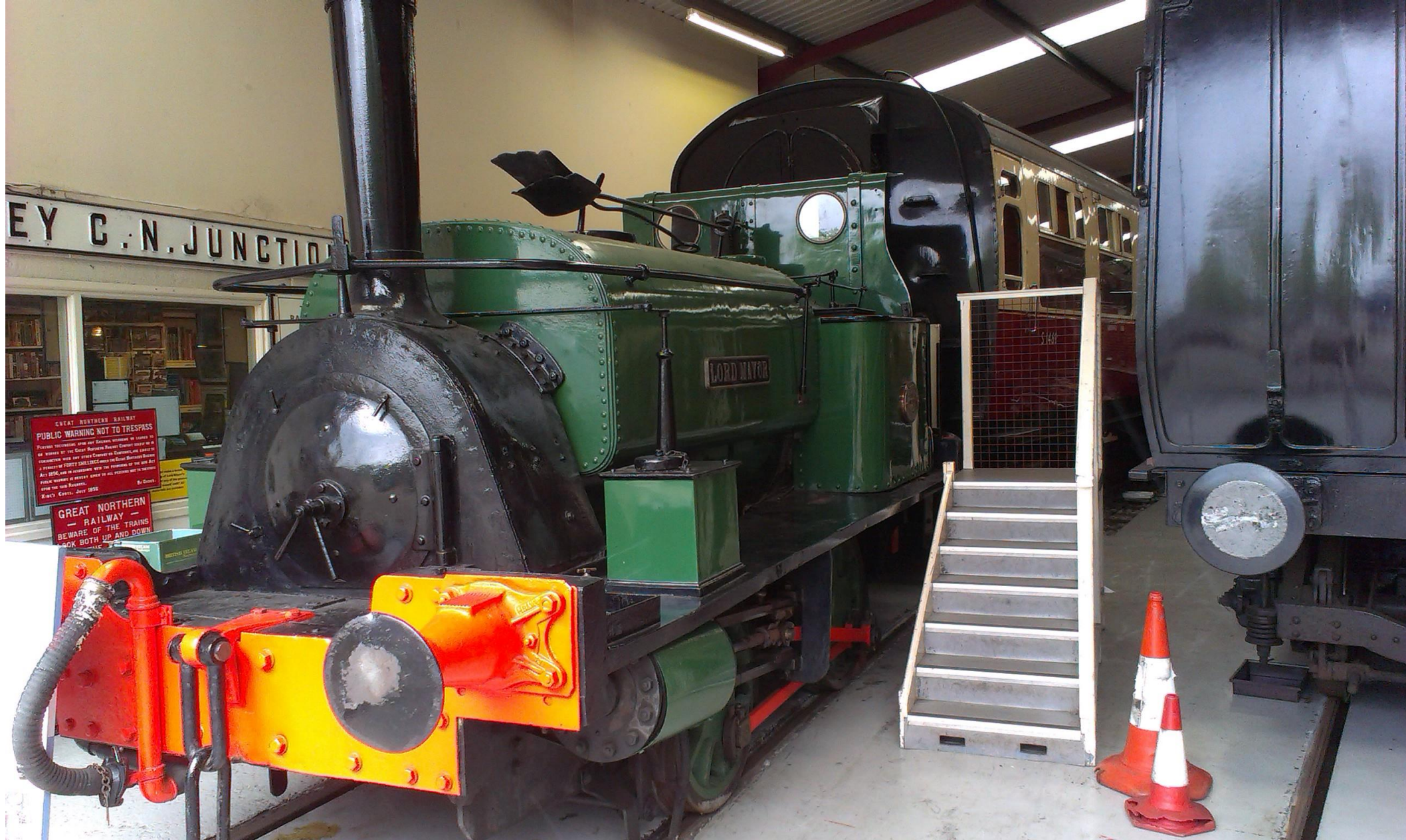
The Museum at Ingrow Station