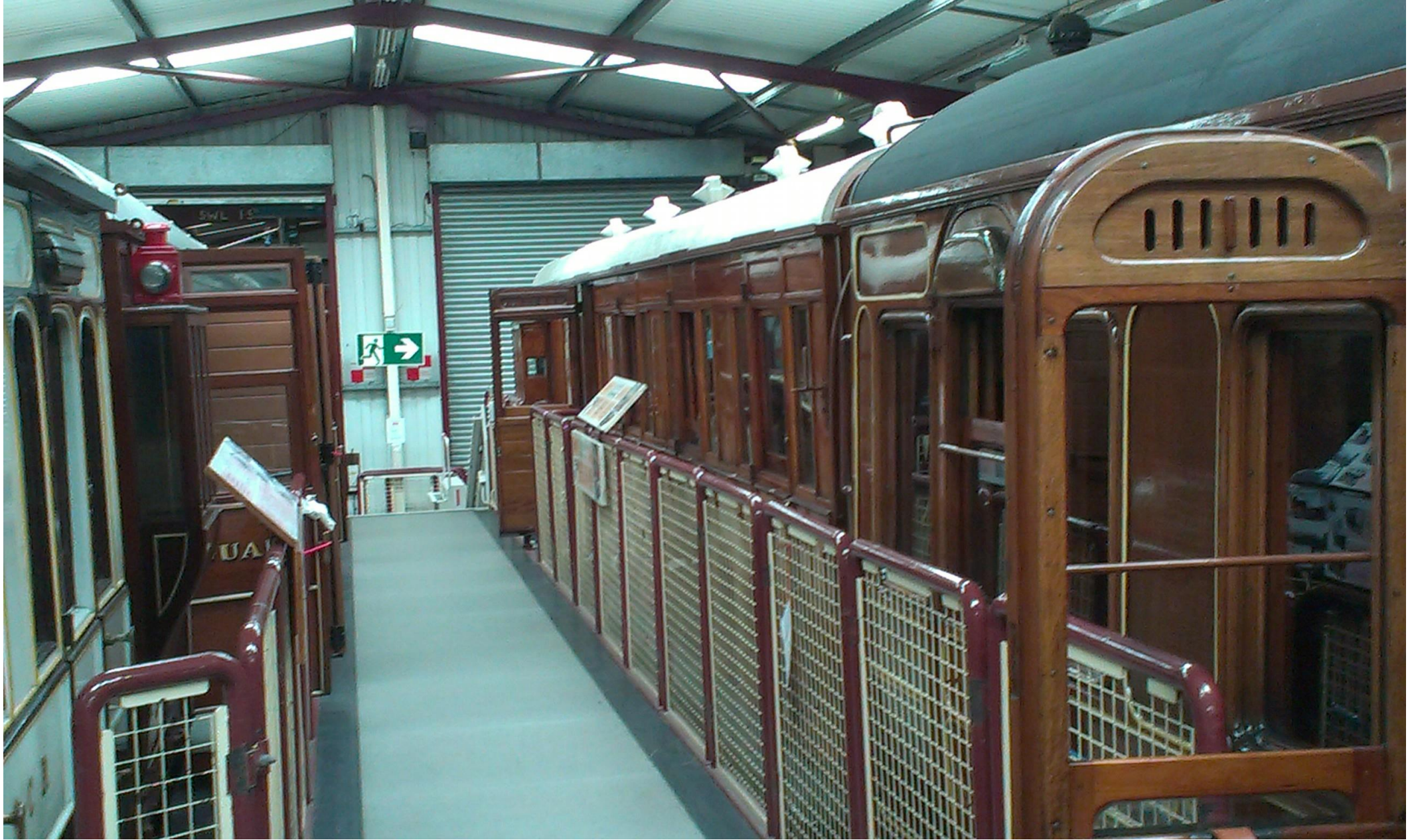
The Museum at Ingrow Station