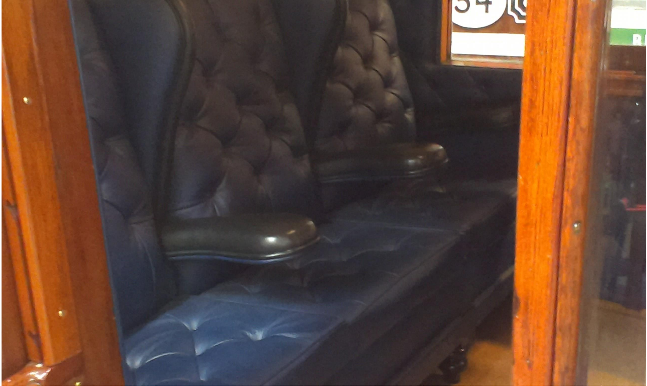
The Museum at Ingrow Station, 1 st Class naturally