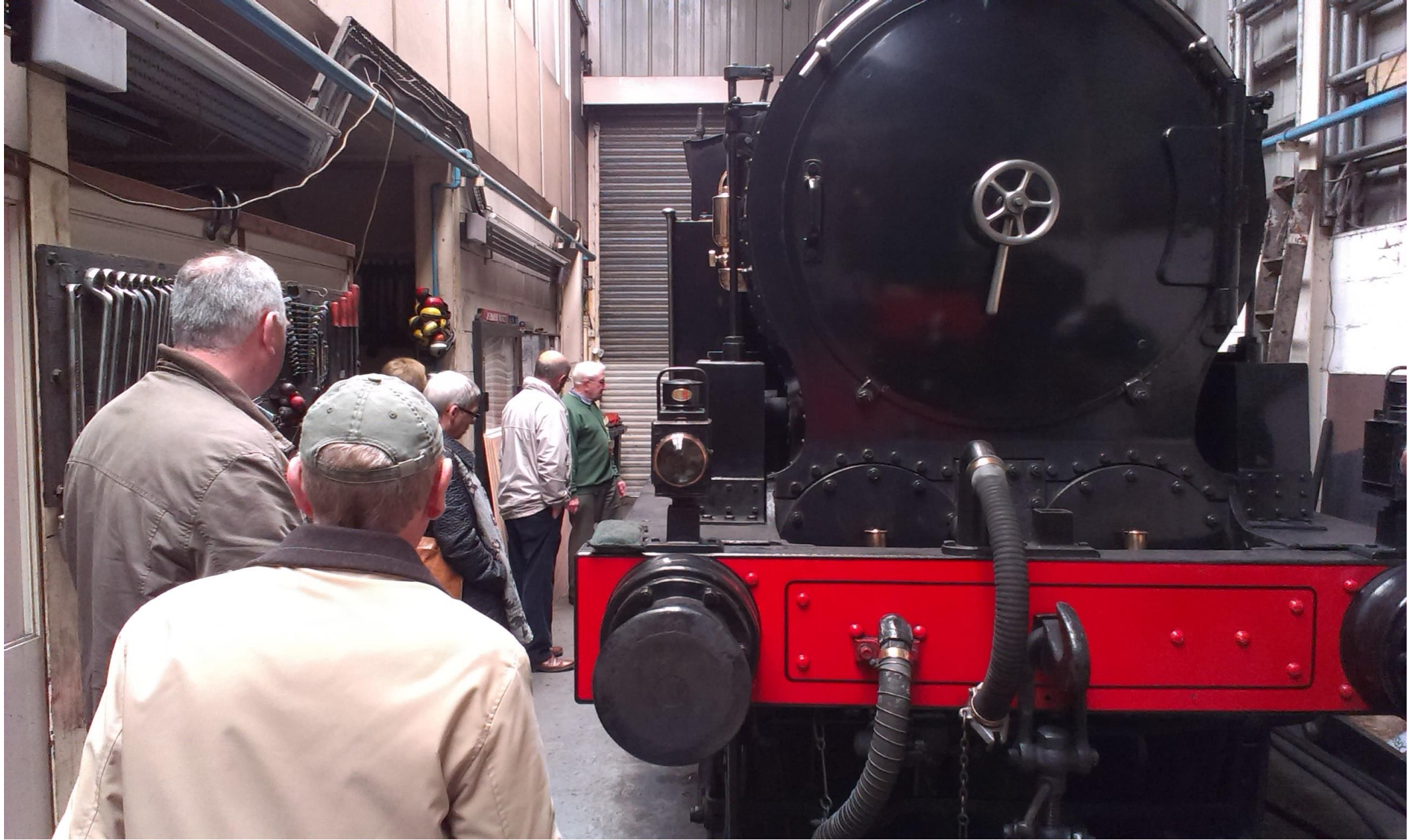
The Workshop at Ingrow Station