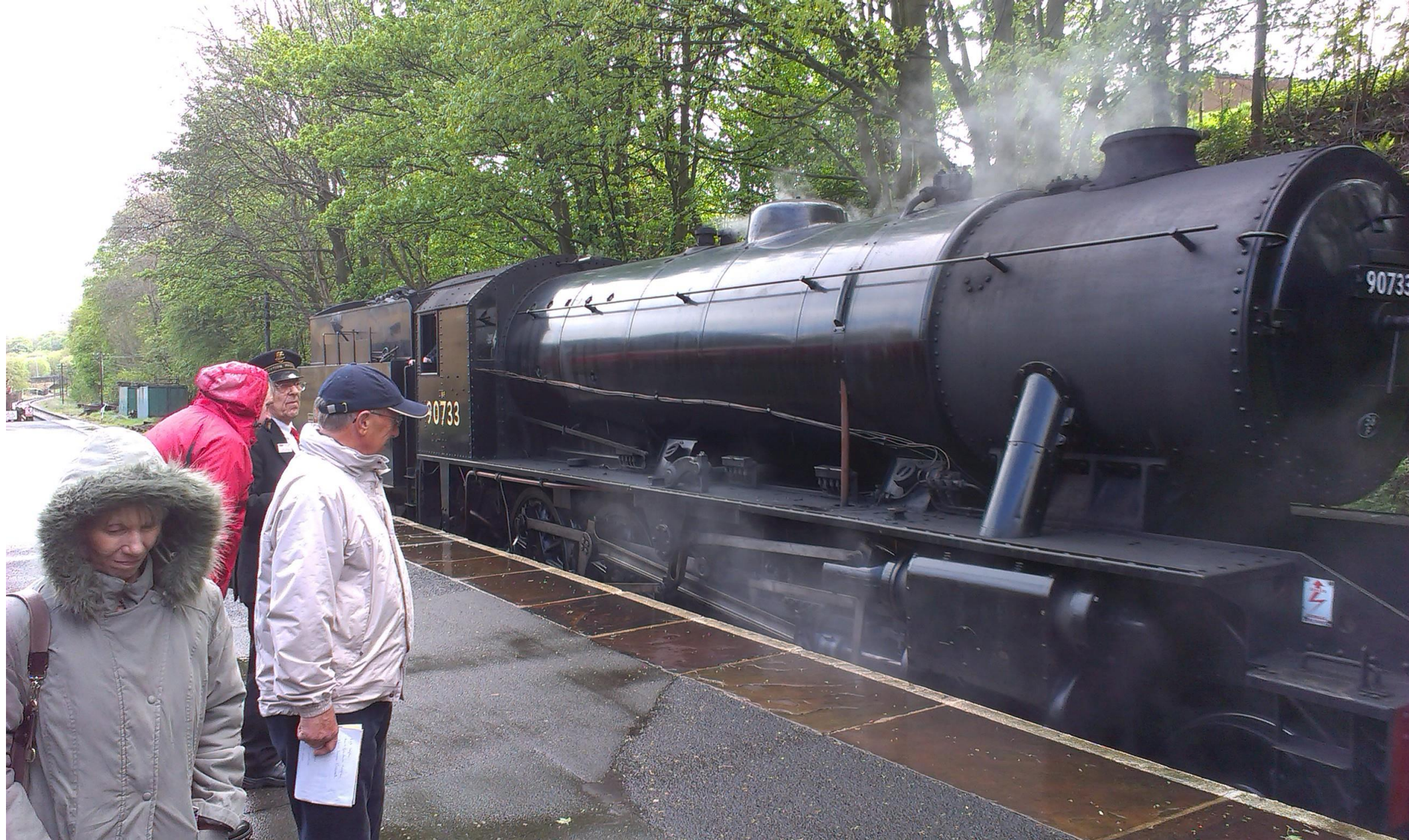
War Department (WD) 2-8-0 locomotive No. 90733